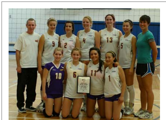
Winners -2009 Camosun Chargers Fall Classic Volleyball Tournament