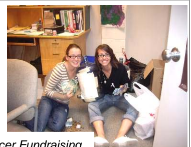
Cop's for Cancer Fundraising