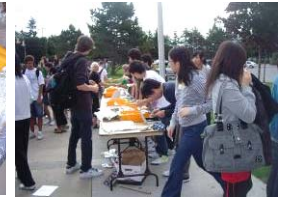
Lunch time Corn Roast